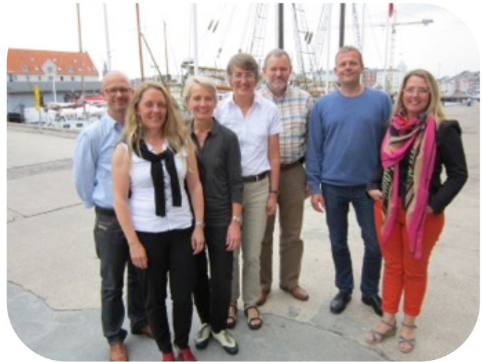
InTerAct partners in front of the Icelandic embassy in Copenhagen. From project meeting 30 August 2012

The project team met again on 30 August 2012 to review progress, and the meeting place was the Icelandic Embassy in downtown Copenhagen, which proved to be a very good location for the meeting. The initial analysis of interviews with managers in the Icelandic marine industry gives an interesting overview of potential opportunities for improving the image of the marine sector and career opportunities in the aquatic food value chain. The interviews were semi-structured relying on a flexible interview guide, allowing new questions to be brought up during the interview in response to what the interviewees say. The Social Science Research Institute conducted the interviews.