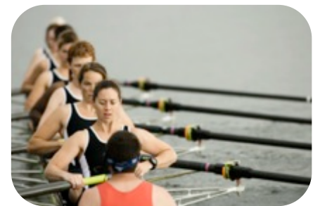
Industry and academia need to improve communications and means for interacting dialogue

In order to increase students' awareness of the industry as a potential professional environment, major emphasis should be on increasing and enhancing promotion of opportunities in all areas of the industry. This is needed to improve the image of the industry domestically and to take advantage of overlooked opportunities on a Nordic level.